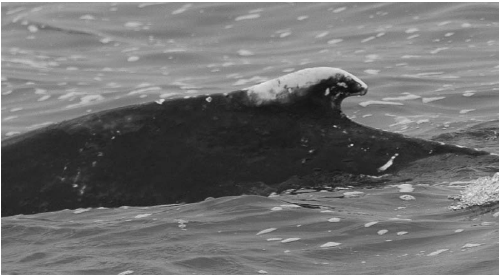
Figure 2. Right (a) and left side (b) of the dorsal fin of the humpback whale in the Marsdiep area, showing a characteristic yellowish-white area over the entire top of the fin, which is more extensive on the left side. The other whitish scratches and scars around the dorsal fin may be of additional use for the individual recognition of this individual during future close encounters.

and a distinct whitish scar pointing down/backwards at the front near the fin base. On the back and right side of the animal, just ahead of the bump, two whitish scars were visible at a distance of twice the finbase length in front of the fin (figure 2a). When seen from the left, much