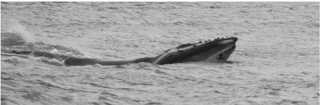
Figure 3. Surface skimming humpback whale. Swimming at the surface, with open mouth against the four knots flood current in an area later identified as a frontal zone between murky Wadden Sea water (background area) and clearer North Sea water (foreground area). The top photo shows the animal from behind, with the blowholes prominently visible and with the upper jaw fully level with the water surface.

(figure 2b). The whitish area was clearly visible from the front, but even from behind the whitish pattern could be noted. The flukes of this whale were never seen above the surface.