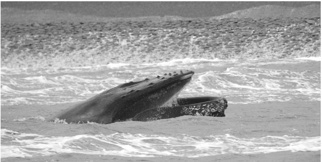
Figure 4. Rising higher out of the water, the humpback whale is surface feeding. With a water-filled mouth it is preparing to filter.

zig-zag course, frequently returning to its starting position from where it would resume swimming slowly against the current.