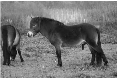
Figure 3. Exmoor ponies in a nature reserve in the Netherlands: a. Three year old Exmoor ponies in winter coat and; b. Three year old stallion, showing a deep lower jaw.

with low variability. Similar results were found by Vilà et al. (2001) and Jansen et al. (2002), who both found a low variation in the mtDNA sequences of Late Pleistocene Alaskan horses. They suggested this might be a feature of natural populations. The low level of diversity among Exmoor ponies may be due to a direct maternal link with a North-European wild pony type, but might also be due to a population bottleneck.