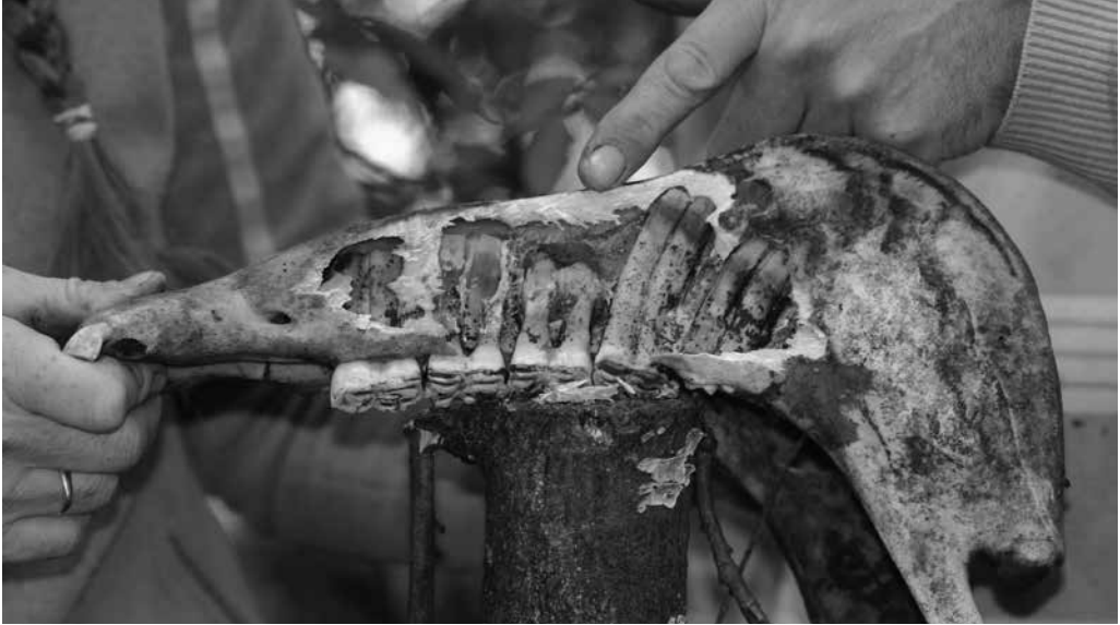
Figure 2. Partly dissected lower jaw of a deceased adult Exmoor pony in 2012, showing a deep lower jaw with deeply rooted molars and premolars set in a radial pattern.