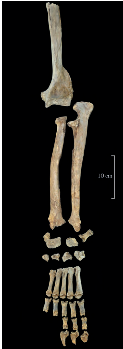
Figure 3. Left front leg of the brown bear from Noordwijk.

The skeletal material is a large portion of a left front leg. All the skeletal elements are present except for one second phalanx, two third phalanges and most of the sesamoid bones (figures 3 and 4). Overall the bones are well-preserved: most of the skeletal elements are complete and they only show slight cracking due to dehydration. The proximal end of the humerus is fragmented and the ulna partly fragmented, but all the parts are still present. Two of the three third phalanges are fragmented distally. The good preservation is indicated by the high collagen yields, taken before dating the sample. The good preservation, the representation of skeletal elements and the location of the find supports the possibility that originally, a large part, possibly a complete skeleton was preserved. Unfortunately, it was not possible to study the overlying sediments as they were removed during the restructuring of the landscape.